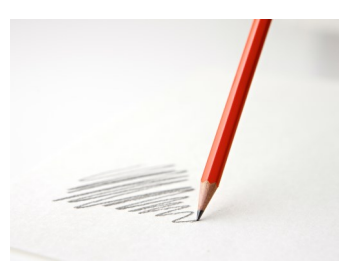
Draw a picture that showcases examples of onomatopoeia.